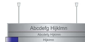
Directional • Directional 8" x 36"