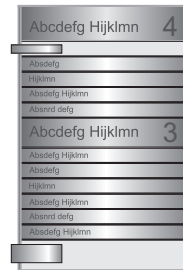
Directory Directory 36" x 24"