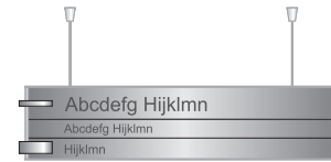
Directional • Directional 8" x 36"