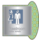
Regulation • Emergency Evacuation 12" x 12"