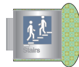
Projecting • Projecting 12" x 12"