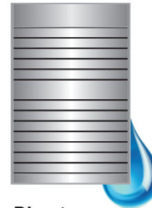
Directory • Directory 36" x 24"