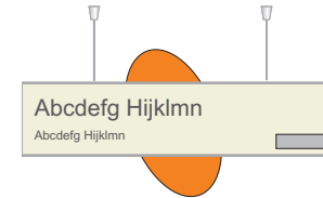
Directional • Directional 8" x 36"