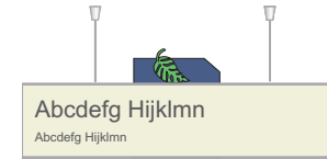
Directional • Directional 8" x 36"