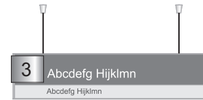
Directional Directional 8" x 36"