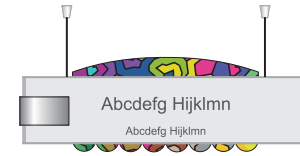
Directional Directional 8" x 36"