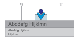
Directional • Directional 8" x 36"